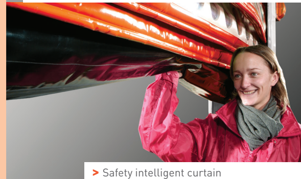
> Safety intelligent curtain

The multi-composite frame perfectly guides the sides of the Intelligent Curtain, reducing wear and noise. The toughness of the side guides, their ability to absorb an impact without becoming permanently distorted and the absence of paint guarantee a durable, corrosion-free appearance and a repair friendly design.