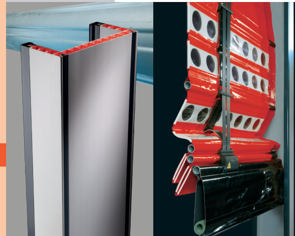
> Thermal break frame > Side guide with curtain

The transparent material allows people to see oncoming traffic. The materials are anti-fatigue and treated against UV and cracking. The TR450 vision panels span the whole width of the door.